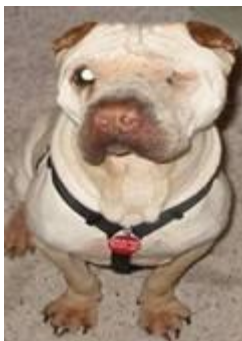
Nov Pei Mate Page 5