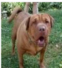
Scarlet's Kids Page 4