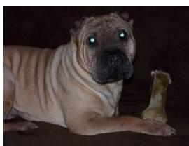
Happy Tails Page 9