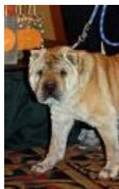
Scarlet's Seniors Page 8